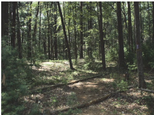
Sen Ki's public hiking trails at 1255 High Street

We all experience delays as we travel back and forth across Gay Street, Clapboardtree Street and other roads in Westwood as traffic merges toward the highways. One of the great benefits of living in Westwood is encountering scenic views that provide some respite to our hectic lives and remind us of the restorative power of nature. Our “gateways to Westwood” - streets including Clapboardtree, Gay, Hartford, Mill, and Summer - offer rolling old stone fences, wooded forests, and open fields along with protection for habitat. We are reminded that this is one of the reasons many of us chose to live in our town.