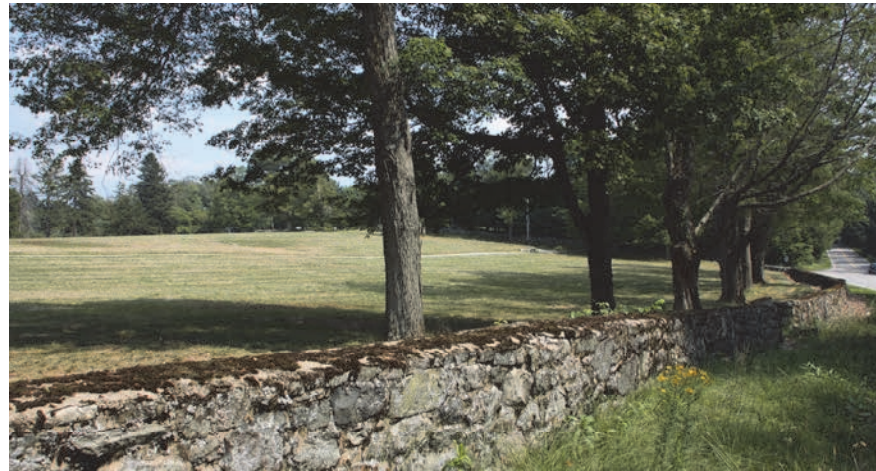
On reverse side: Scenic view at 590 Gay Street